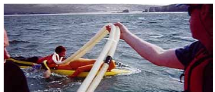
Measuring the physical demands of rescuing a casualty.