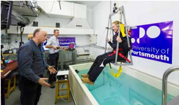
Are you ready? Immersing Shirley Robertson, Olympic 2-times gold medalist.