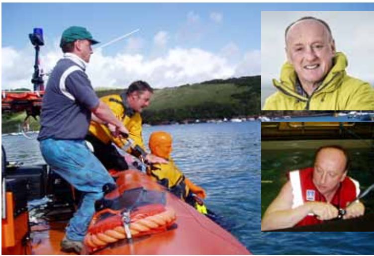
Measuring the demands of lifting a casualty from water onto Salcombe Lifeboat.